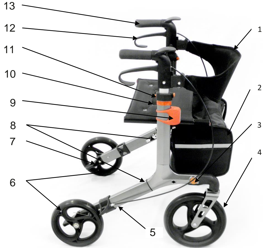
Figure 2: Product overview