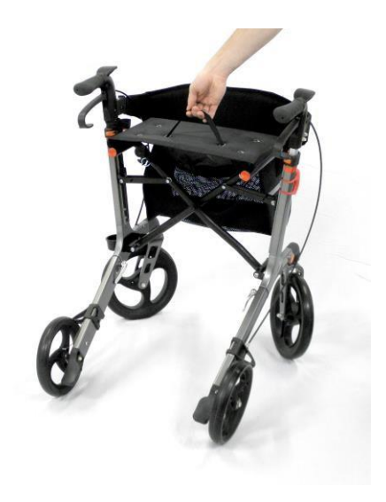
Figure 7 Figure 8